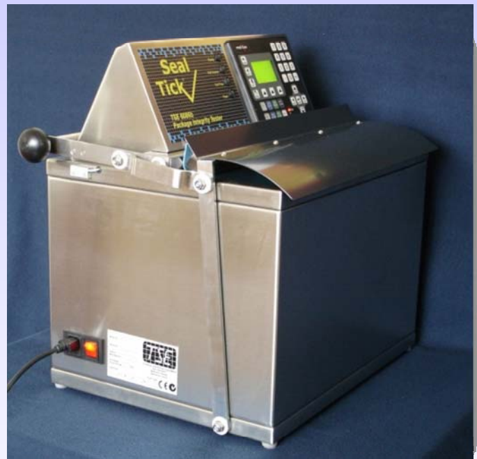
Seal Tick in operation position. Pass/Fail lamps indicate when test is finished.

Compressed air consumption: 60 Ltrs/min intermittent