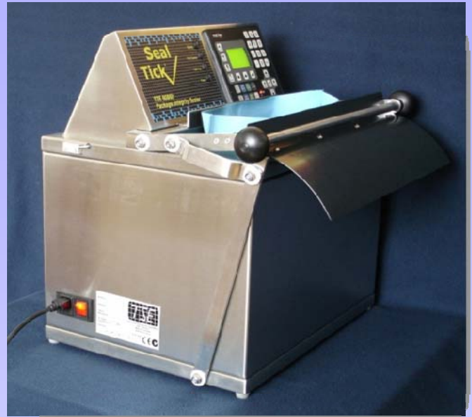
Seal Tick in open position ready for package to be loaded. Closing the handle starts the test cycle.

Bestech Australia Pty Ltd (also trading as Technical & Scientific Equipment ) Unit 7, 35 Taunton Drive Cheltenham VIC 3192 Ph: +61 3 9584 1133 Fax: +61 3 9584 5477 Web: www.techsci.com.au , www.bestech.com.au Email: sales@bestech.com.au